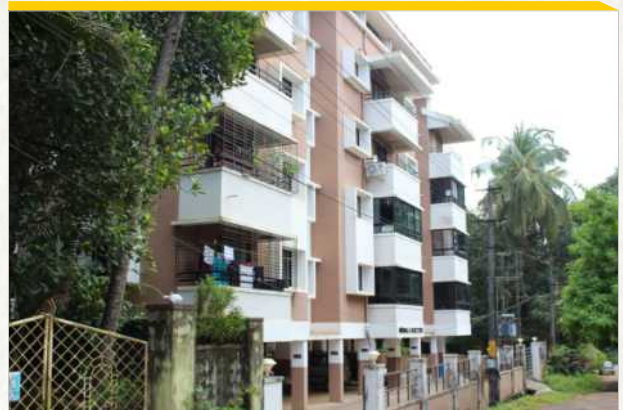
Nirmala Shelters, Indrali