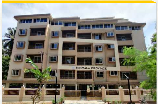
Nirmala Province, Kunjibettu

Buoyed with their grand success in the above projects, Nirmala Constructions have ventured in to this new project “ NIRMALASERENITY ” near the serene environment of Udupi.