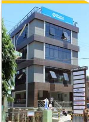
Kalmanje Towers, Ajjarkad

Nirmala Constructions ensures that there is no compromise on the quality of its projects and ventured in to residential building projects to provide customer friendly, budget conscious clientele, value added home plans through their residential apartments.