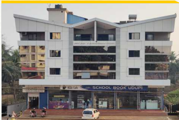
Laxmi Narasimha Towers, Kunjibettu